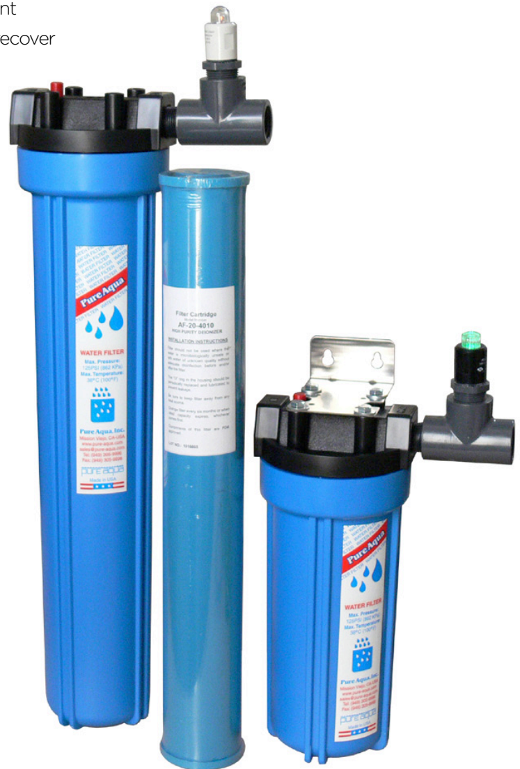
RCD-20 with testlight quality indicator.

All plastic construction provides sturdy, corrosion proof and attractive housing.