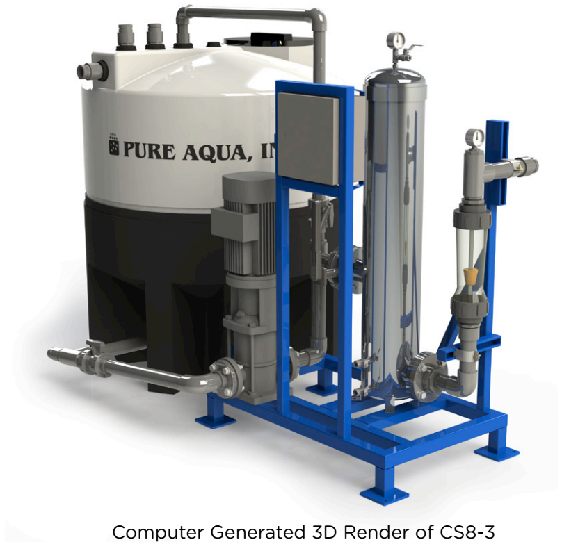
Computer Generated 3D Render of CS8-3

Pure Aqua supplies a full line of standard and fully customizable membrane cleaning systems, all of which are engineered using advanced 3D computer modeling and process design software for accurate and customized solutions.